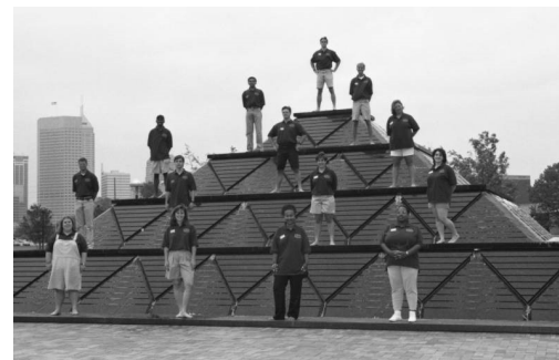
1997 Wood Plaza, Orientation Services

The Student Employment Program provides on-going training, resources, and support for supervisors of student employees. Now with a full-time director, STEP is developing programming to enhance students' sense of belonging on campus, and support their academic and career success. Student employees benefit from a dedicated lounge and study space within the library.