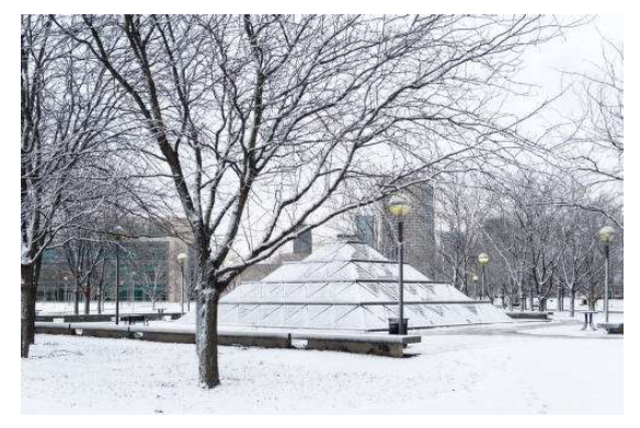
2016 Wood Plaza fountain

Librarians, staff, and student employees at the Services & Information Desk answer thousands of reference questions. Additionally, <u>subject librarians</u> conduct indepth one-on-one research consultations for students and faculty via telephone, chat, e-mail, in-person, and via zoom on all aspects of the research process such as choosing a topic, determining information needs, finding resources, and evaluating and citing those sources.