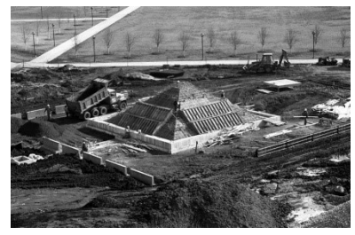
1995 Wood Plaza construction

IU Indianapolis' institutional digital repository, <u>ScholarWorks</u>, shares over 36,000 articles, posters, reports, theses, educational materials and historical documents submitted by members of the campus community in order to address research communities' need for new outlets in scholarly communication.